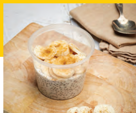
Chia Seed Pudding

Overnight soaked oats in almond milk and black currant juice, pumpkin & flax seeds, rhubarb and fresh strawberries.