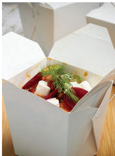
Hot Lunch Box

Our catering is served in hot trays so everyone at the office can help themselves, we supply all plates, cutlery and serviettes.