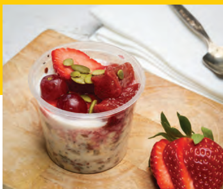
Fruit & Nut Bircher

Yoghurt with the options of a crunchy granola, fresh seasonal fruit including passionfruit, mango and mixed berry.