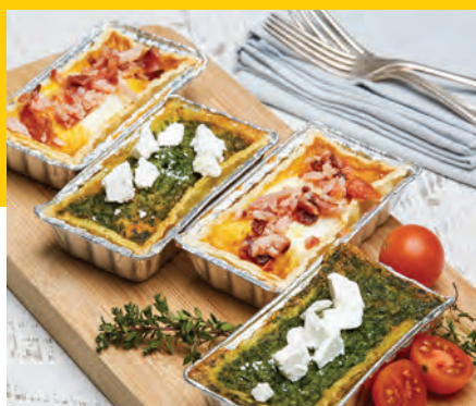
Egg & Bacon Spinach Tarts

Free range eggs, Tasty cheese and local bacon served on toasted fresh rolls, bagels or muffins.