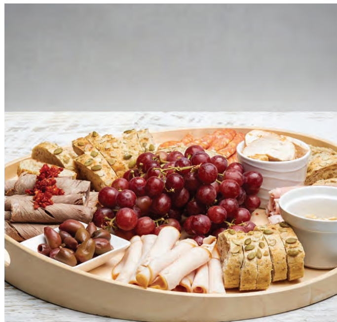
Continental Deli Platter

A variety of house made dips, water crackers, pita bread & vegetable wedges