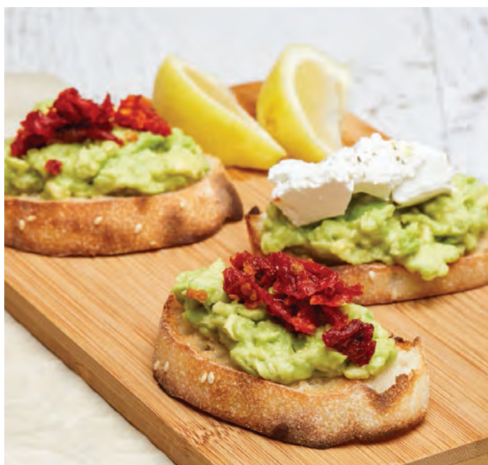
Mini Avocado Smash

Delicious and healthy naturally protein packed pudding with fresh mixed berries or banana and cinnamon.