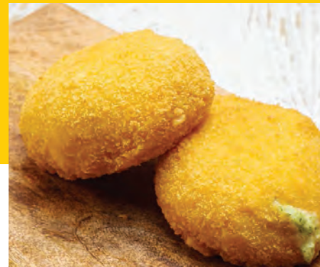
Mini Chicken Kievs

Delicious spring rolls with sweet chili sauce. 2 per serve.