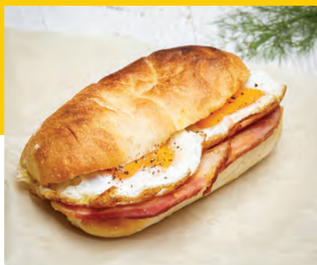
Egg & Bacon Roll

1 per person is the recommended serving size, minimum order 6 per item.